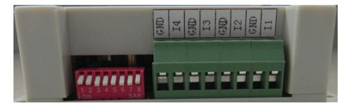
Pic 1. DIP Switch